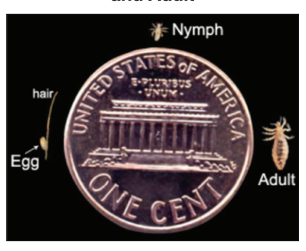
Figure 4. Comparison of Egg, Nymph, and Adult