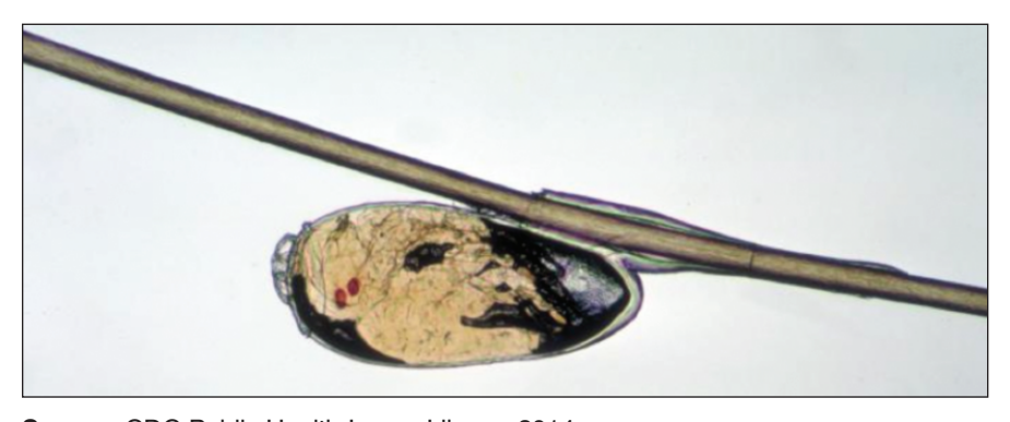
Figure 3. Viable Nit