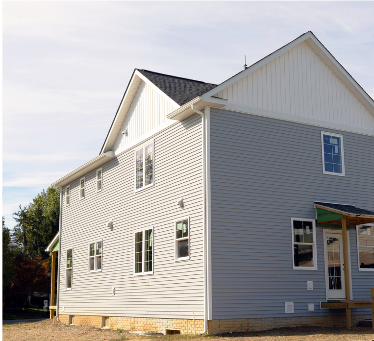
34<sup>TH</sup> STUDENT HOUSING PROJECT